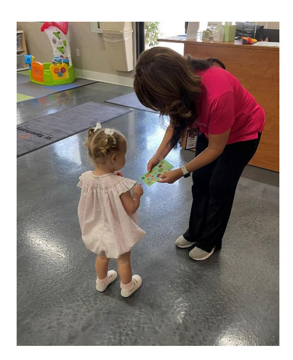
See you next time, parenting center!