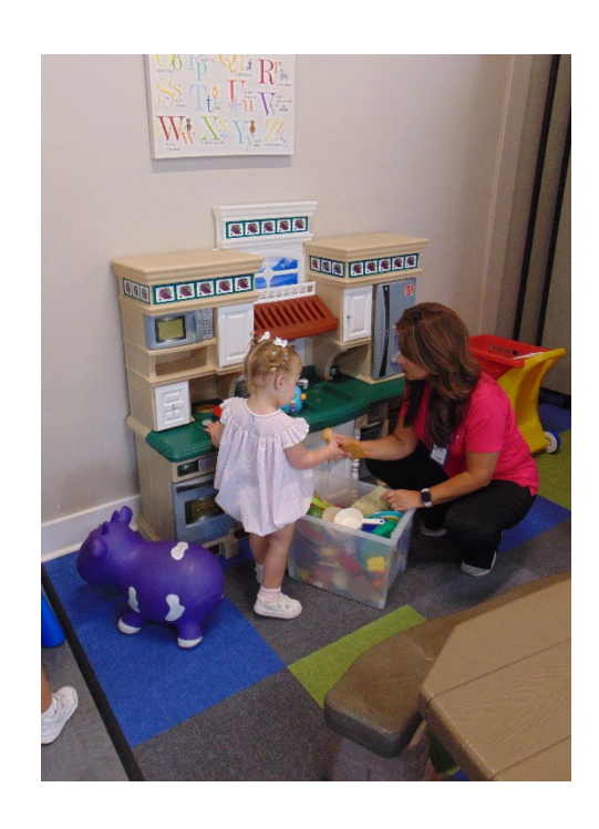
I can play next to my friends and take turns!